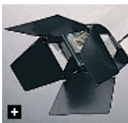
114 Barn doors (black)