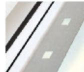
I - □ Square light spill