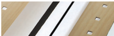
22 Maple (Chrome insert detail)